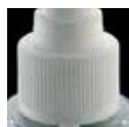
AVZ (EUR 5, 18-415, 20-410, 22-415, 24-410, 24-415)