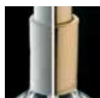
AVL (EUR 5, 18-415)