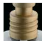
FV (18-415, 20-410, 24-410)