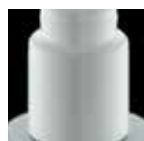
AVLG (EUR 5, 15-415, 18-415, 20-410, 20-415, 22-410, 24-410, 24-415)