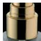
AVR (18-415, 20-410, 24-410)