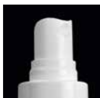
Standard (Mark VI)