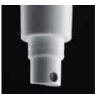
Inverted Spraying (Mark VII Max)