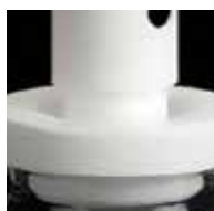
GS 30, GS 31 (Mark VII Max)