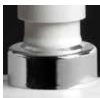
20 mm (for 0.16 and 0.21 ml Mark VII Max outputs only)