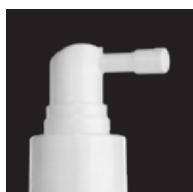
Spray Extender (Mark VI & Mark VII Max)