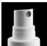
Compact (Mark VII Max)