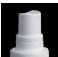
Finger Grooved (Mark VII Max)